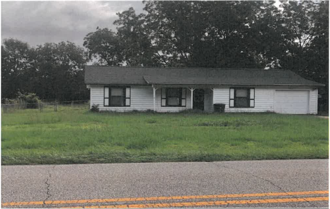
308 N. Hickory Re-inspection 6/23/2020 by Krystal Bodiford