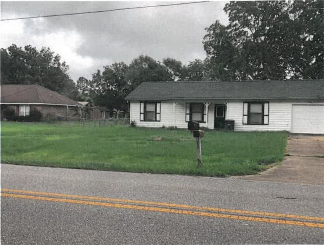
308 North Hickory inspected by Krystal Bodiford on 6/8/2020