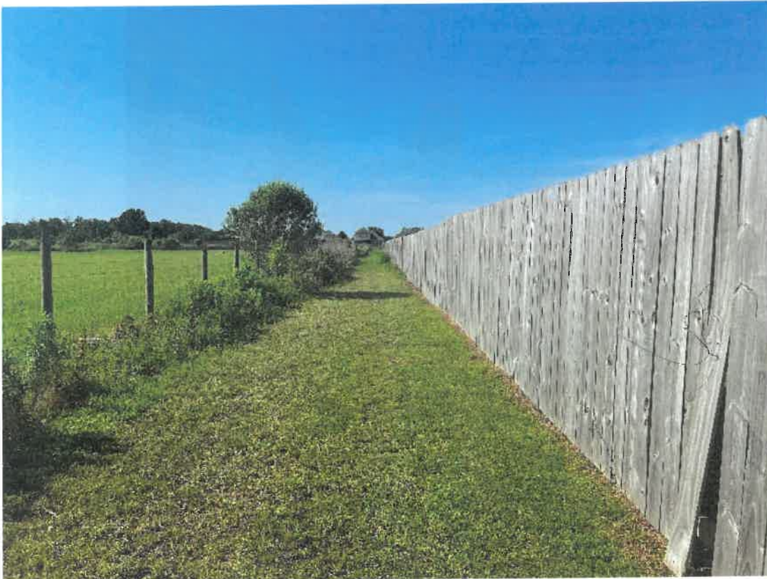
1. East side of common area 2