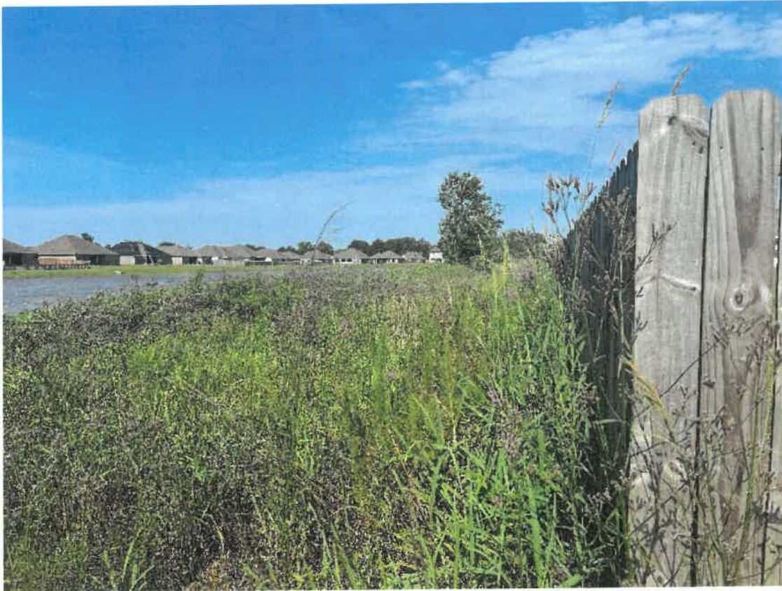
2. Overgrown common area at south swale between Village @ Hickory and Lafayette Place. Vegetation +4' in height