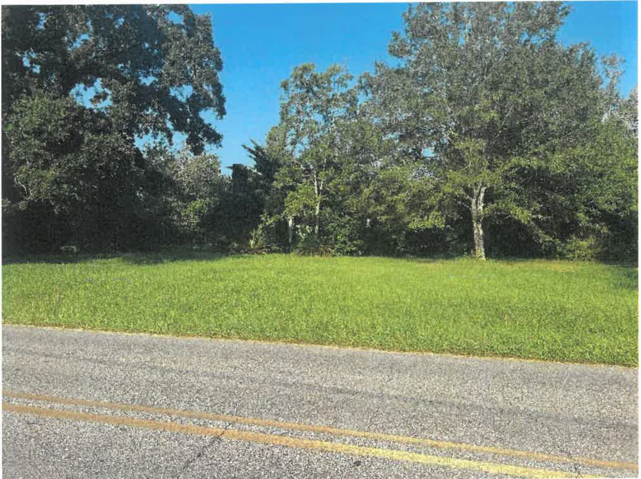
1. View of home is obstructed by trees, and bushes