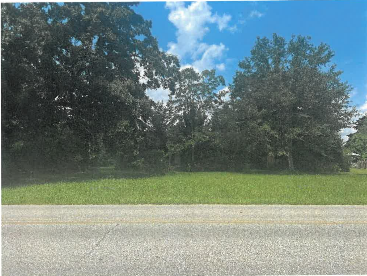
1. View of front yard, grass is over 12" in height, bushes in front of home overgrown obstructing house

Project: 1207 North Alston Date: Jul 12 2024 03:21:44 PM