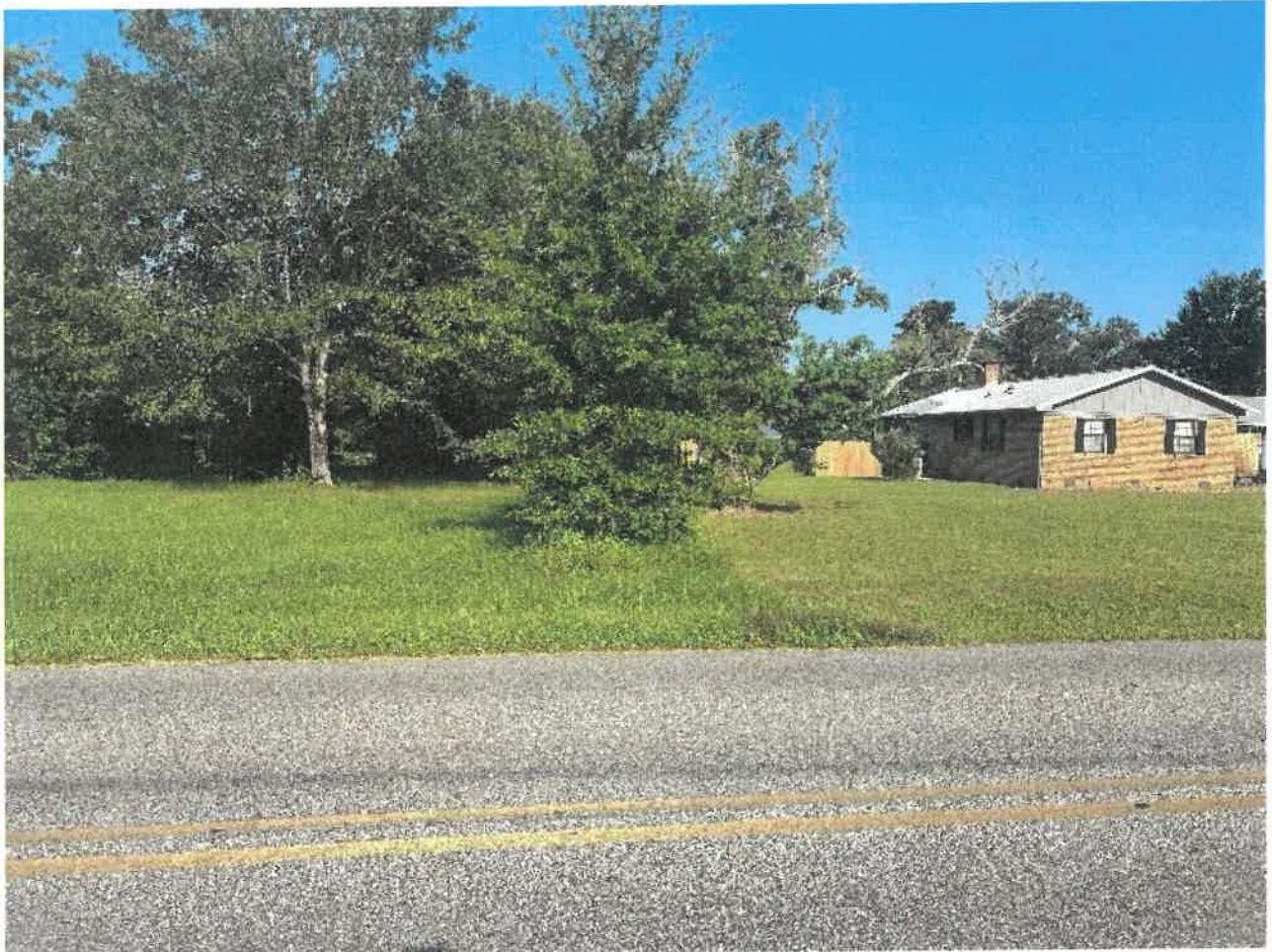
3. Comparison of neighboring property