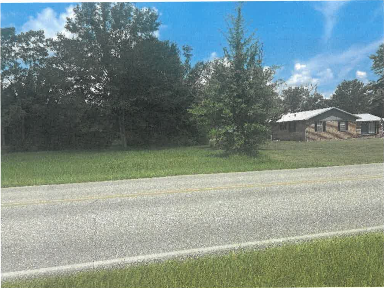
2. Grass height comparison of neighboring property