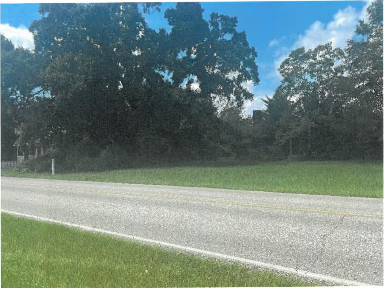
3. Overgrown vines on south side of property