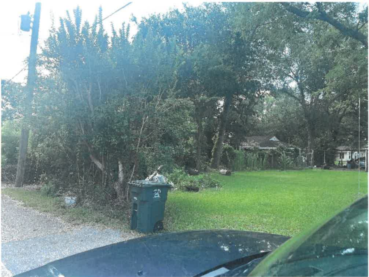
1. Overgrown vegetation in the backyard, weeds and bushes exceeding the height of the privacy fence. Picture taken from Alley Way facing east.

Project: East Orange complaint Date: Jun 06 2025 11:22:34 AM