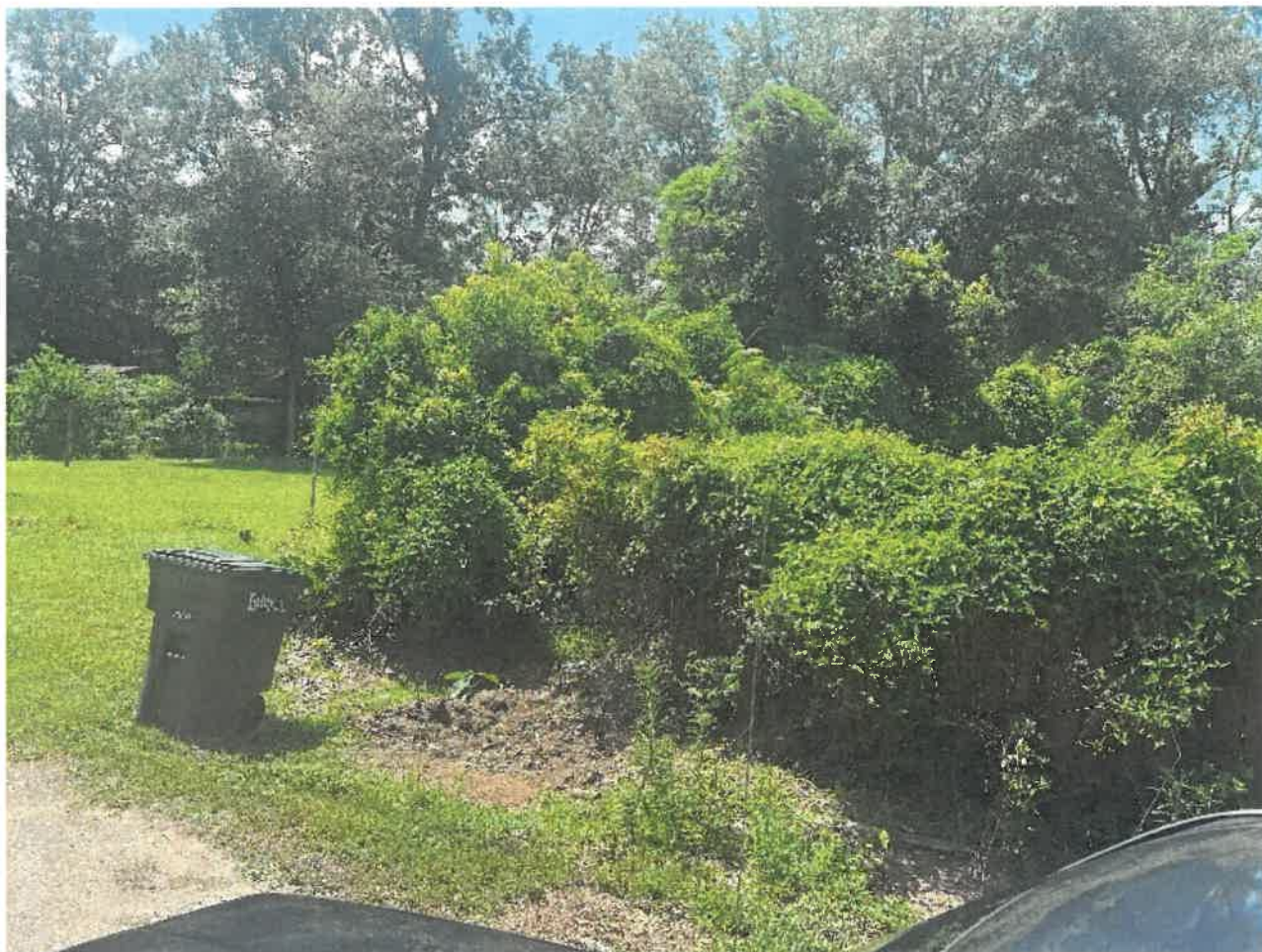
6. Northeast corner of the property