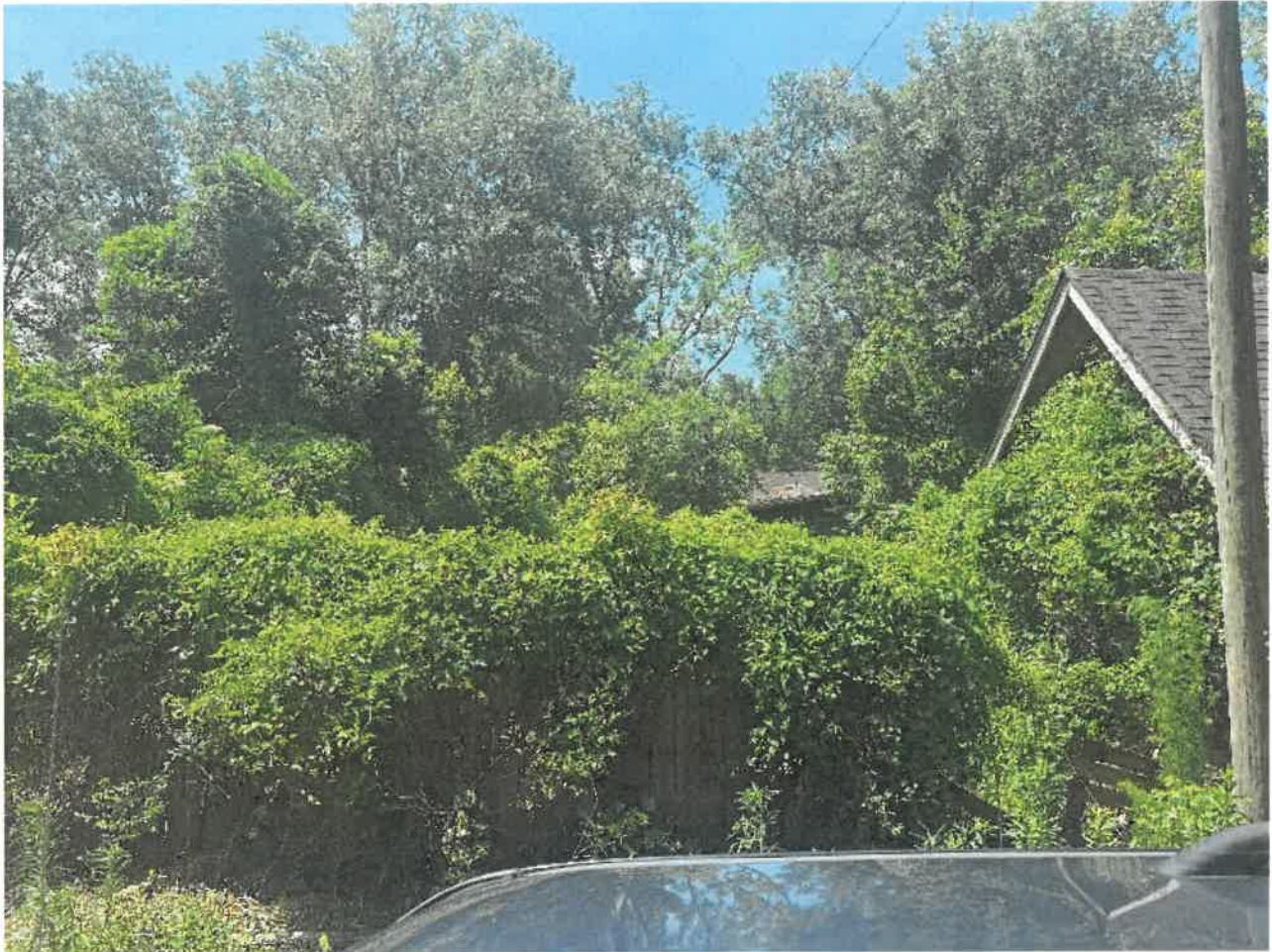
4. Overgrown vegetation covering the privacy fence and garage. Unable to see the backyard due to overgrowth.