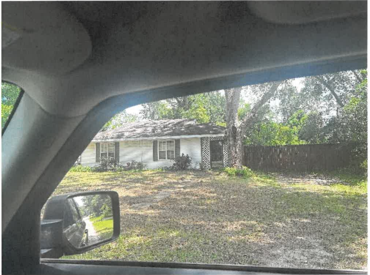
9. It appears the front yard is maintained