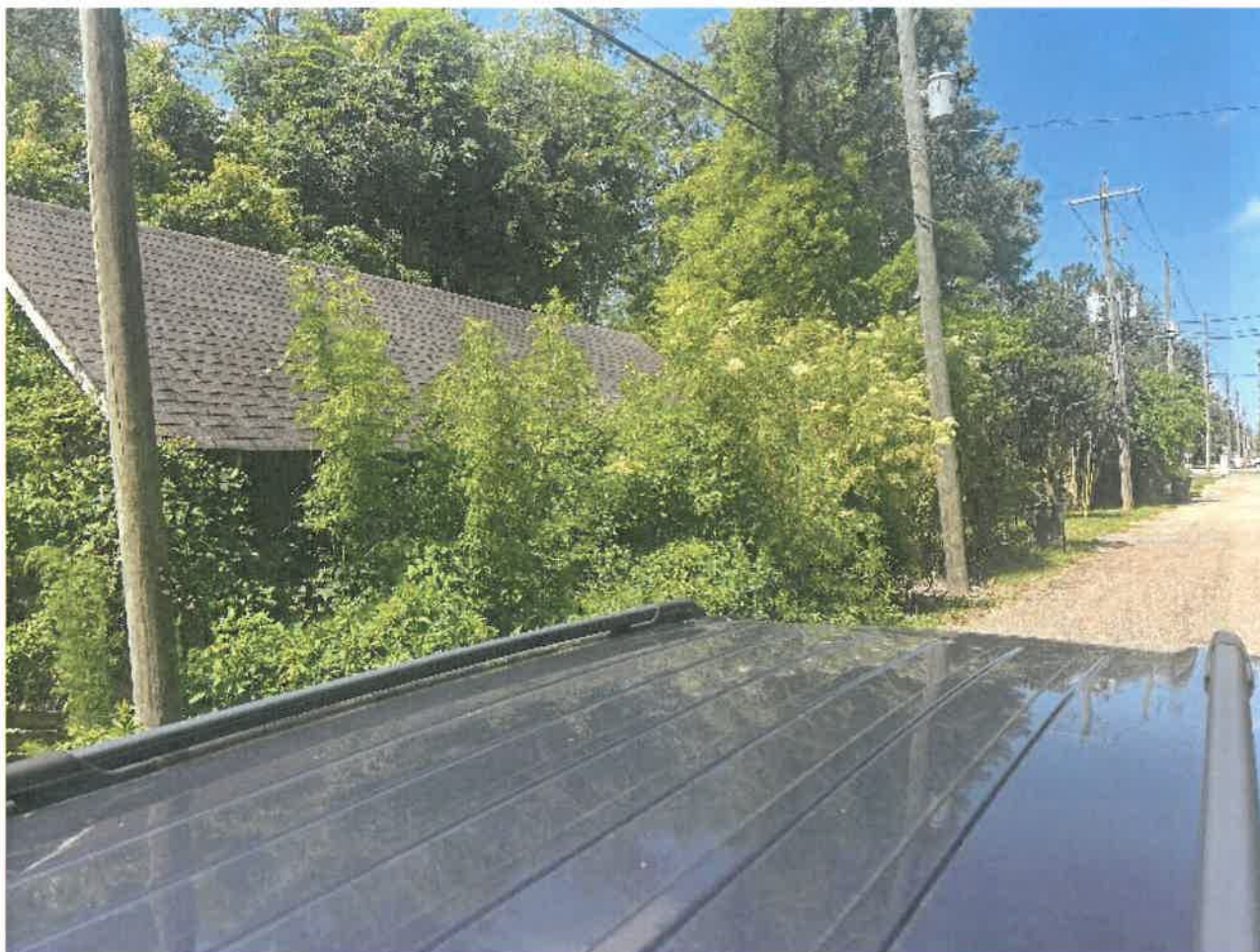
5. Overgrown vegetation along the alley way.