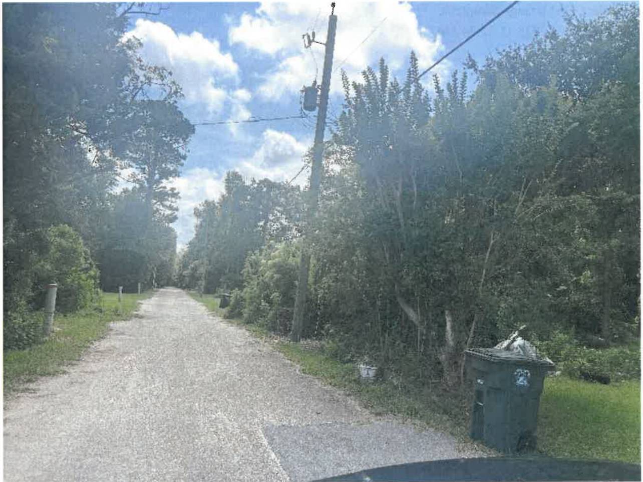
2. View of backyard from alley facing east